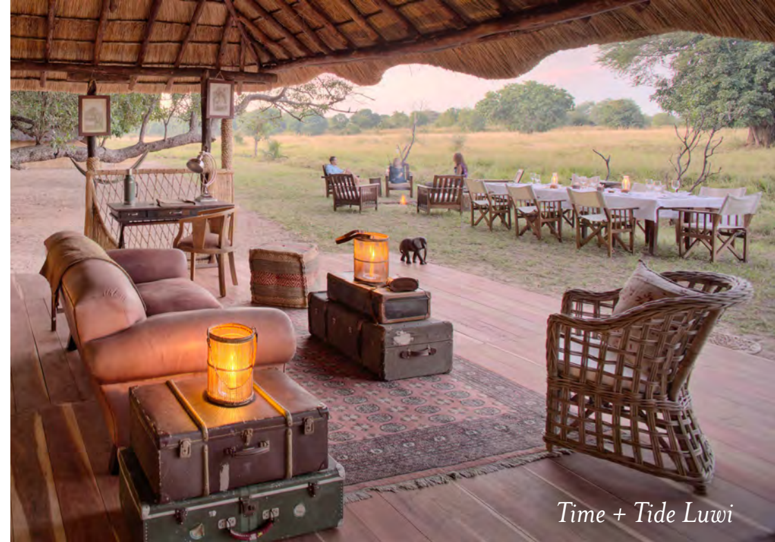
Time + Tide Luwi