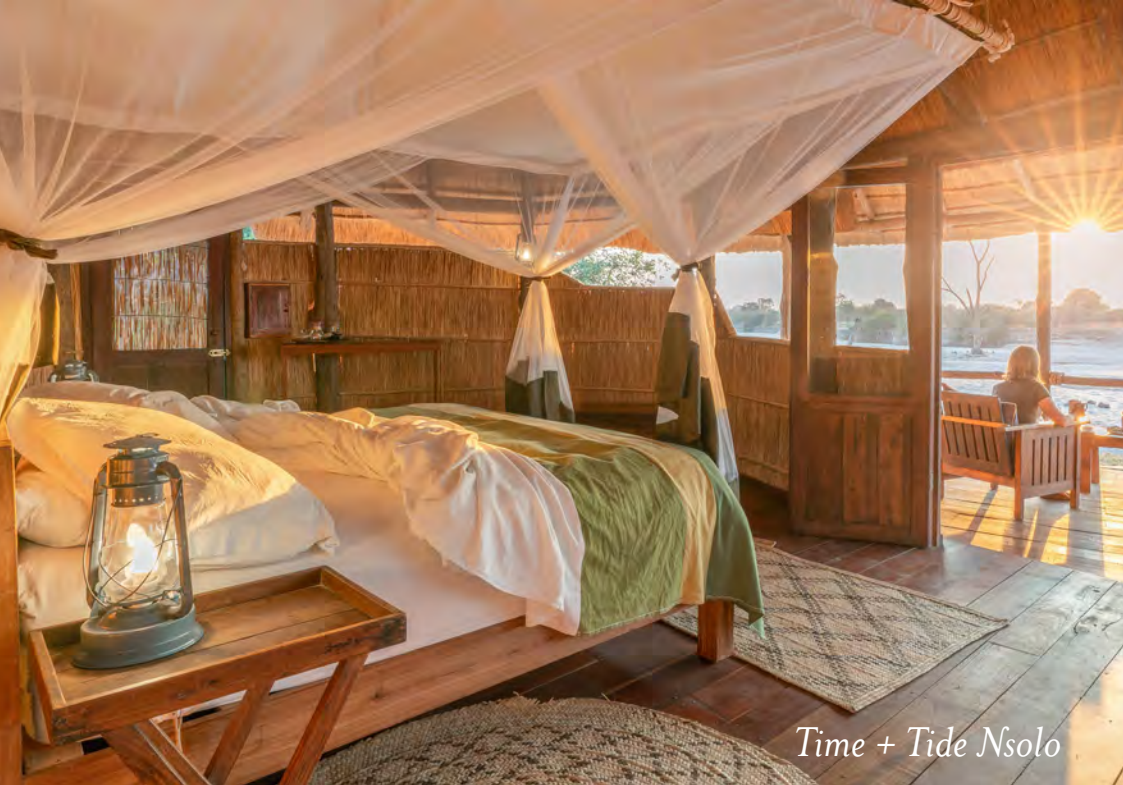
Time + Tide Nsolo