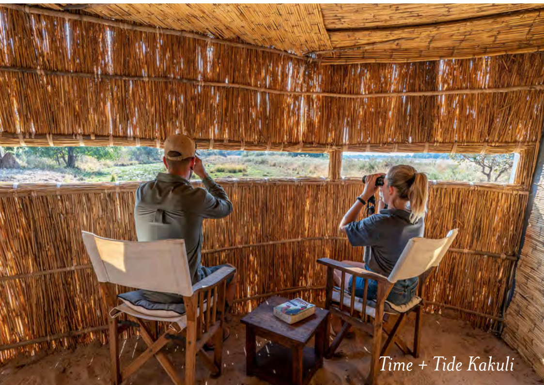
Time + Tide Kakuli