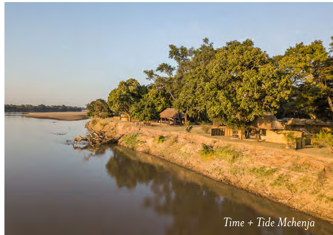
Time + Tide Mchenja