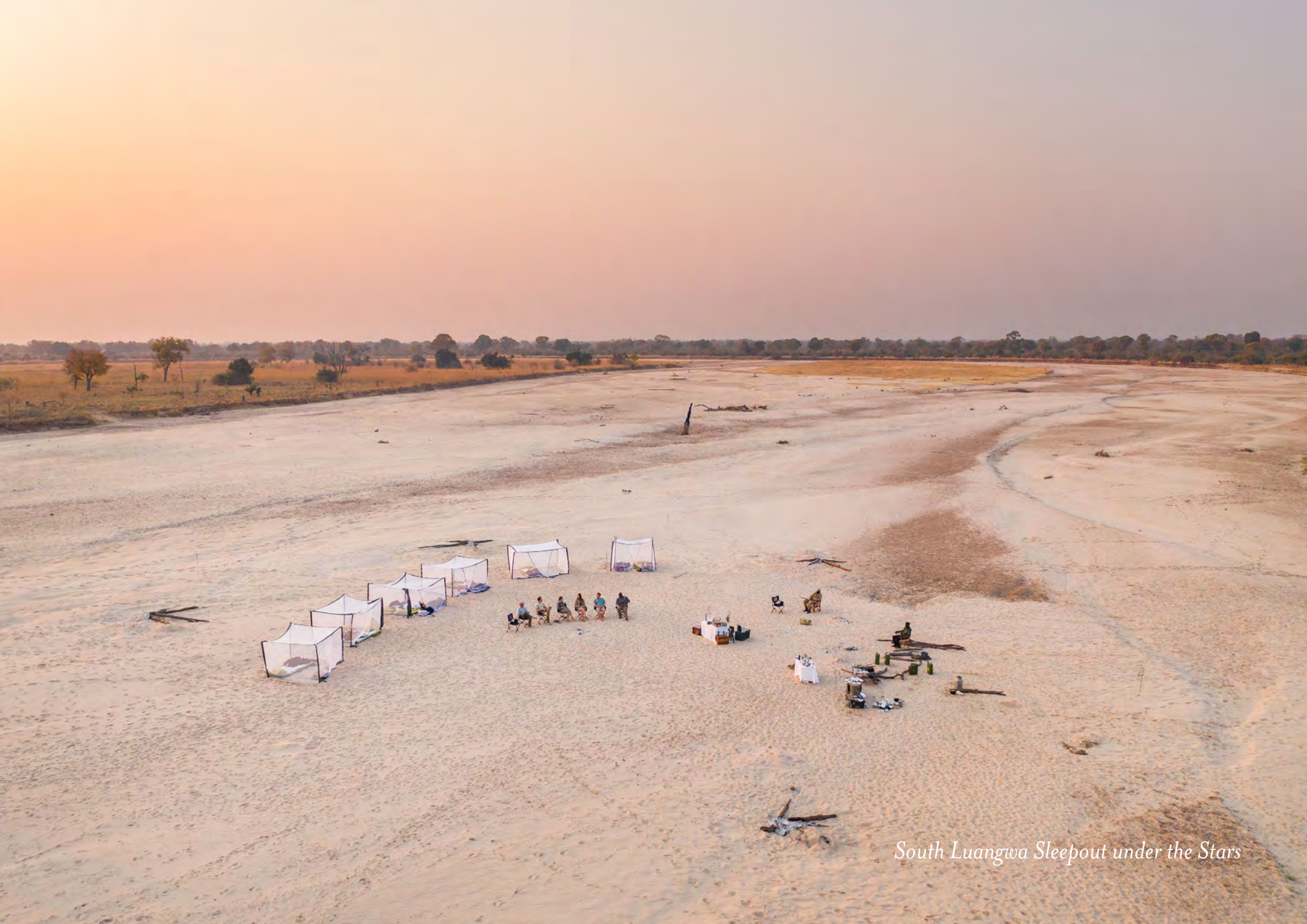
South Luangwa Sleepout under the Stars